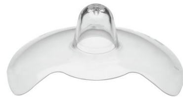
Cut away shield

Good for infants who collapse the cut-away nipple shield during suckling